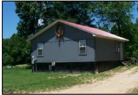
W1212 - 548 SANDY TRAIL. JUST IMAGINE... Your own 2 bedroom cabin on the river. Watch the river go by from your 19x16 deck and enjoy the peace and quiet. The recent flood in 2008 did not get into this cabin. Only minutes away from town. All for $65,000! Call today!