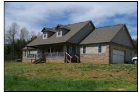
W1236 - 5959 HWY. 328N. On this beautiful hilltop setting is a 2236 sq.ft., 3bed/2bath home built in 2004. Living area is 16x33 with vaulted ceiling and gas log fireplace. Kitchen has beautiful birch cabinets & stainless steel appliances that stay, and a breakfast nook. There is a dining room with bay window, office/mud room & a utility room. There are 2 hot water heaters, CH&A, a 24x30 shop building w/concrete floor, electricity & two 8' doors. All this on app. 25 acres with a pond for $182,000. Call today & make your appointment.