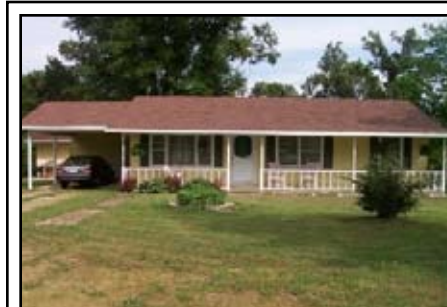
W1213 - 1756 HWY. 67N. COUNTRY CHARM WITH CITY CONVENIENCE. All on app. 4.5 acres. This home has 1732 sq.ft., 4 bedrooms, 2 baths, formal dining room, nice kitchen & cozy family room w/gas log fireplace, hardwood floors, ceramic tile, 12x12 sun porch, partial basement and 12x16 storage building. Great garden spot and so much more. Call today for an appointment and we will fill you in on the rest this property has to offer. $93,000