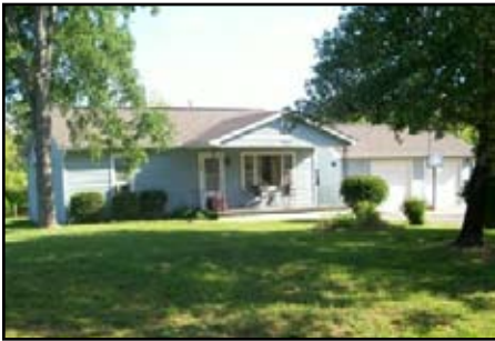
W1230 - 9026 HWY. 62W. Nice, 2 bedroom home with detached garage, 2007 roof, washer, dryer, refrigerator, stove, and 30x50 shop w/electricity, water & concrete floors. Fenced, surveyed, live creek, all on 10 acres. Additional acreage is available.