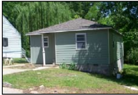
H1415 - 1602 CRISMON. This cute 2 bedroom home is perfect for newlyweds. The inside has been remodeled, so you do nothing but move in and live! CH&A and priced right @ $49,000