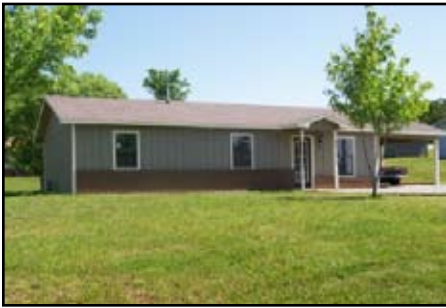
H1414 - 24 EMMA DR. JUST MOVE RIGHT IN!! This 3 bedroom home has been remodeled inside and out! New carpet, flooring, paint, plus kitchen and bath have been redone. Ready to show and ready to go @ $70,000! Call today!