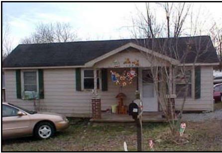
H1418 - 2205 DREW. WOW!!! ANYONE CAN AFFORD THIS!!! One bedroom, frame home with refrigerator, cook stove, washer, dryer, ventless heat, and window air. All this for only $16,500! Won't last long!