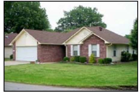
H1416 - 1107 WILSON DR. This 1618 sq.ft. home features 3 bedrooms, 2 baths, 2 car garage and a 13x11 sunroom. Located in town and minutes from everything you need! Use the gas you save to light your own gas fireplace! $99,900 Call Today!